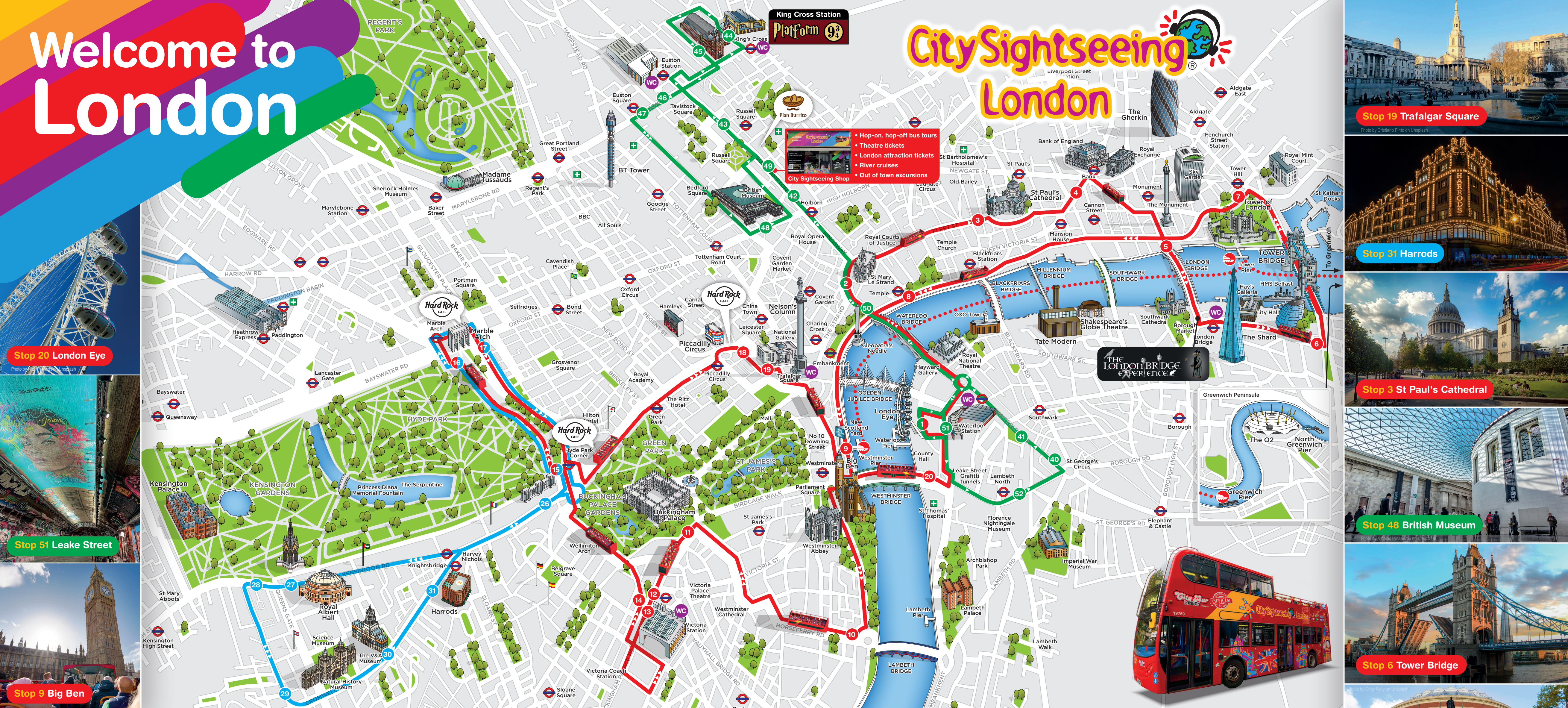
Stop 19 Trafalgar Square