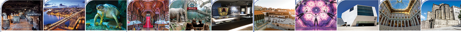
Caves Burmester Near Stop 12 3 | View Serra do Pilar Near Stop 7 | Sea Life Near Stop 3 | Livraria Lello Near Stops 14 | World of Discoveries Near Stop 12 13 | Museu da Demarcação Near Stop 3 | WoW Near Stop 2 | Neonia Near Stop 14 | Casa da Música Near Stop 3 | Palácio da Bolsa Near Stop 12 13 | Igreja de S. Francisco Near Stop 12 13