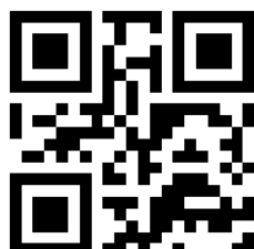
South Coast VYGWNEPH